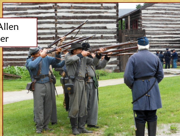
Camp Allen Muster