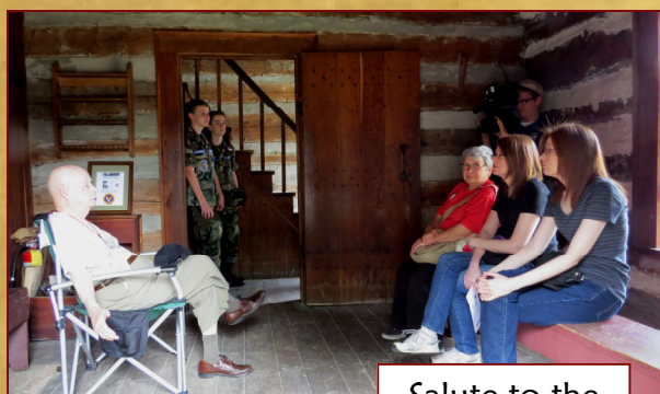
Salute to the Services