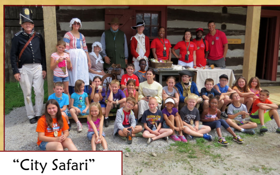
"City Safari" Day Camp