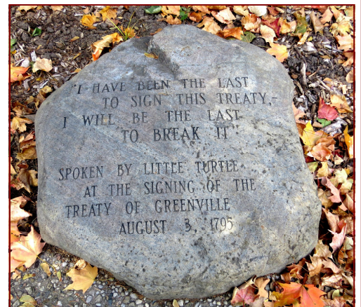
One of the rocks lining the walkway at the Little Turtle Memorial site.