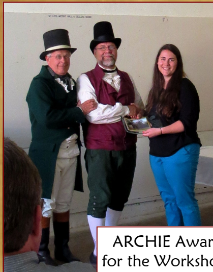
ARCHIE Award for the Workshops