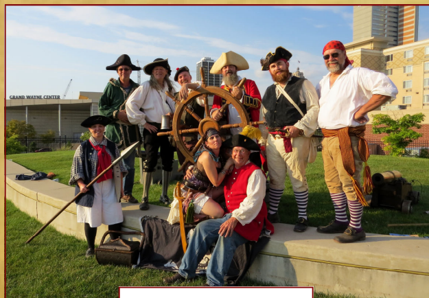
Tincaps Pirate Night