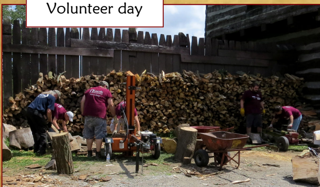
Lincoln Financial Volunteer day