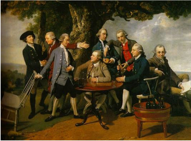
By Johann Zoffany, from 1796

You have researched your clothing; perhaps documented the cut, color, and style and tailored your attire, material culture, and other trappings to your persona. You know exactly who you are, where you are, why you are there, and the date you are portraying. You may even know where you stand politically, religiously, and socio-economically. For those of you who wish to give a more immersive experience for the public, things may start to fall apart as soon as you open your mouth. Your words suddenly jerk a patron back out of the “story” you are presenting and back to the 21 st century.