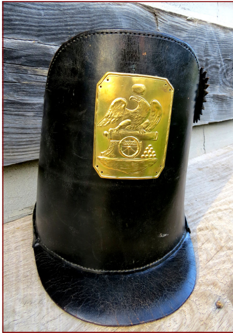
The shakos can be worn with either the gold artillery plate (above) or the silver infantry plate (right).

We also acquired a number of new leather shakos. The earlier period felt shakos tended to fall apart in inclement weather, and most armies of the world were making the change to leather at that time. To go with the shakos, we now have two versions of metal hat plates, which are interchangeable. The silver plates are embossed with an eagle, and were worn by the infantry. The gold plates feature an eagle atop a canon, and were used by the artillery.